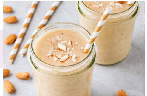
Oats, Apple, Almond and Milk Healthy Smoothie