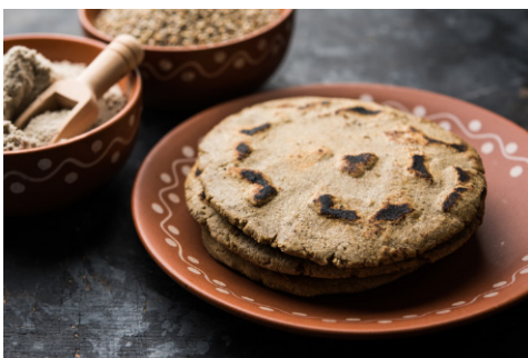
Mixed Sprouts and Bajra Roti