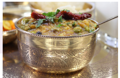
Bajra, Whole Moong and Green Pea Khichdi