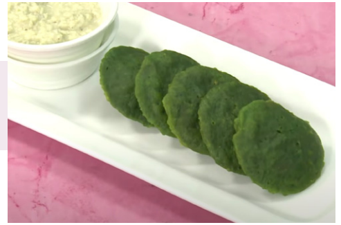
Moong Dal and Spinach Idli