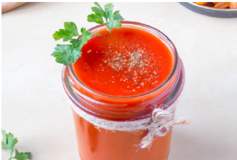
Carrot and Red Pepper Juice