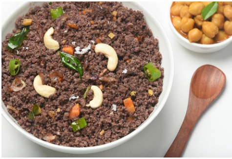
Ragi Rava Upma