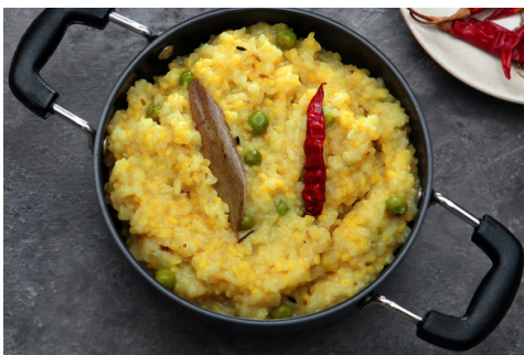
Gehun ki Bikaneri Khichdi